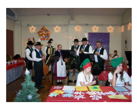
The German Band Edelweiss