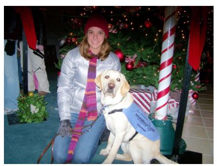
Puppy raiser and her dog