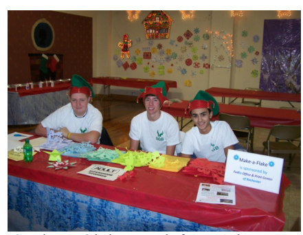
Students Giving Back from Adams High School