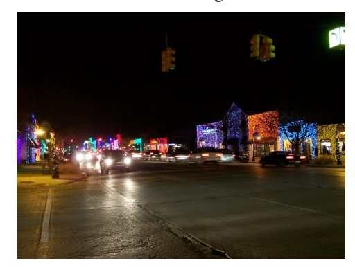
Let there be light